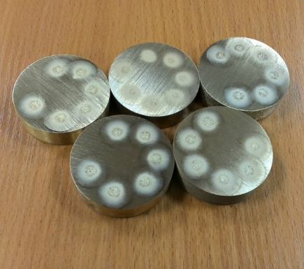
Spark spots on burning samples